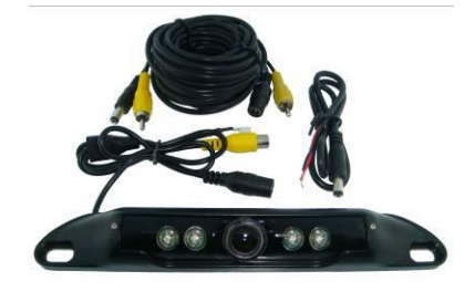
BARCAM 221 Color Camera Digital Distance Markings Standard or Mirror Image (front or rear) Night Vision Illumination Waterproof 21' Power and Video cable