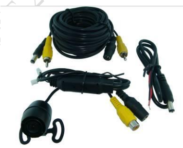
MINICAM 221 Color Camera Digital Distance Markings Standard or Mirror Image (front or rear) Waterproof 21' Power and Video cable