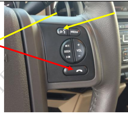
Edge, Explorer, Flex, MKX, F150, Escape, Taurus, F250